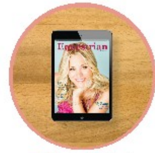
Equestrian The official magazine of the USEF