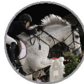
USEF NETWORK.COM Changing the way you look at equestrian sport