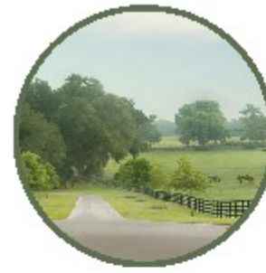
UNITED STATES EQUESTRIAN FEDERATION The national governing body for equestrian sport

USEF Competition Name: SUMMER SIZZLER I & II USEF #7066 Competition Divisions and Rating: Arabian, Half Arabian/Anglo-Arabian, Jr. Exhibitor Arabian, Jr. Exhibitor Half Arabian/Anglo Arabian, Open English Pleasure