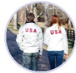
shopUSEF.com A fresh approach to classic equestrian style